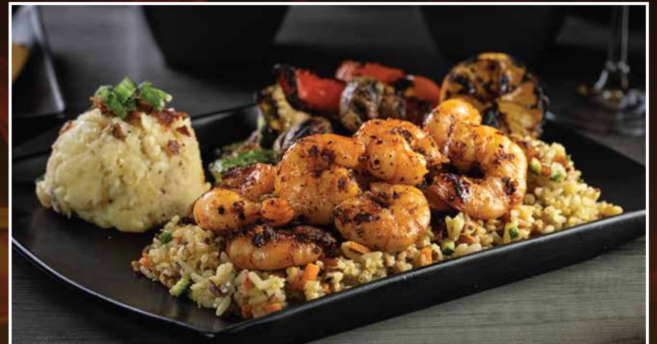
SAN BLAS SHRIMPS

Salmon fillet (220g)*, mashed potatoes and grilled vegetables