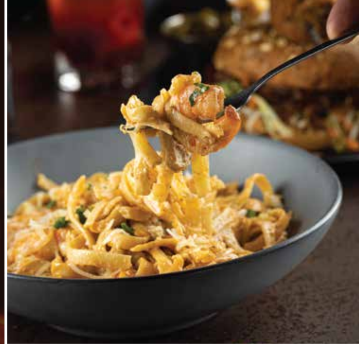
LOUISIANA PASTA WITH SHRIMPS

With shrimps (130g)* $279 With chicken (200g)* $269