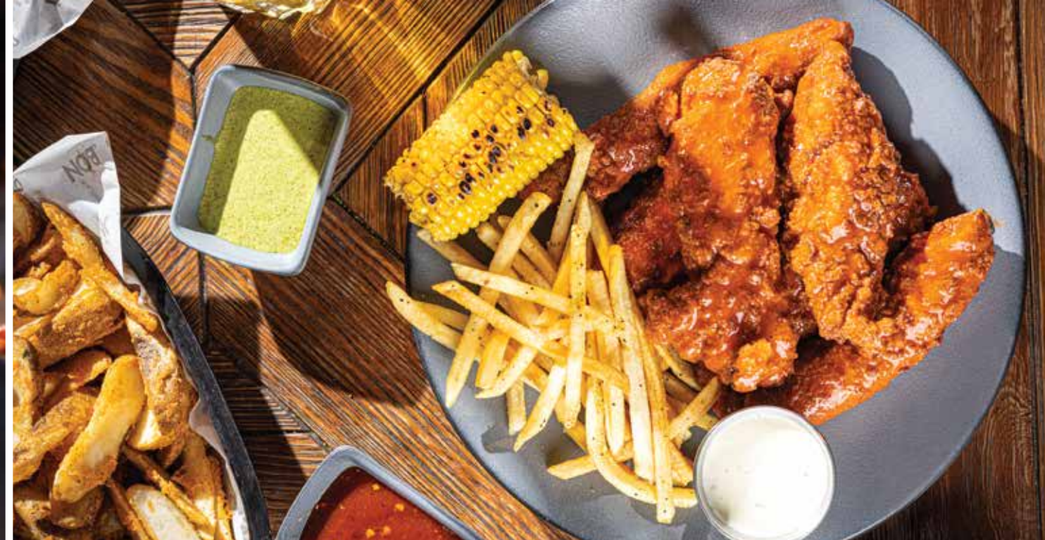
BREADED CHICKEN STRIPS