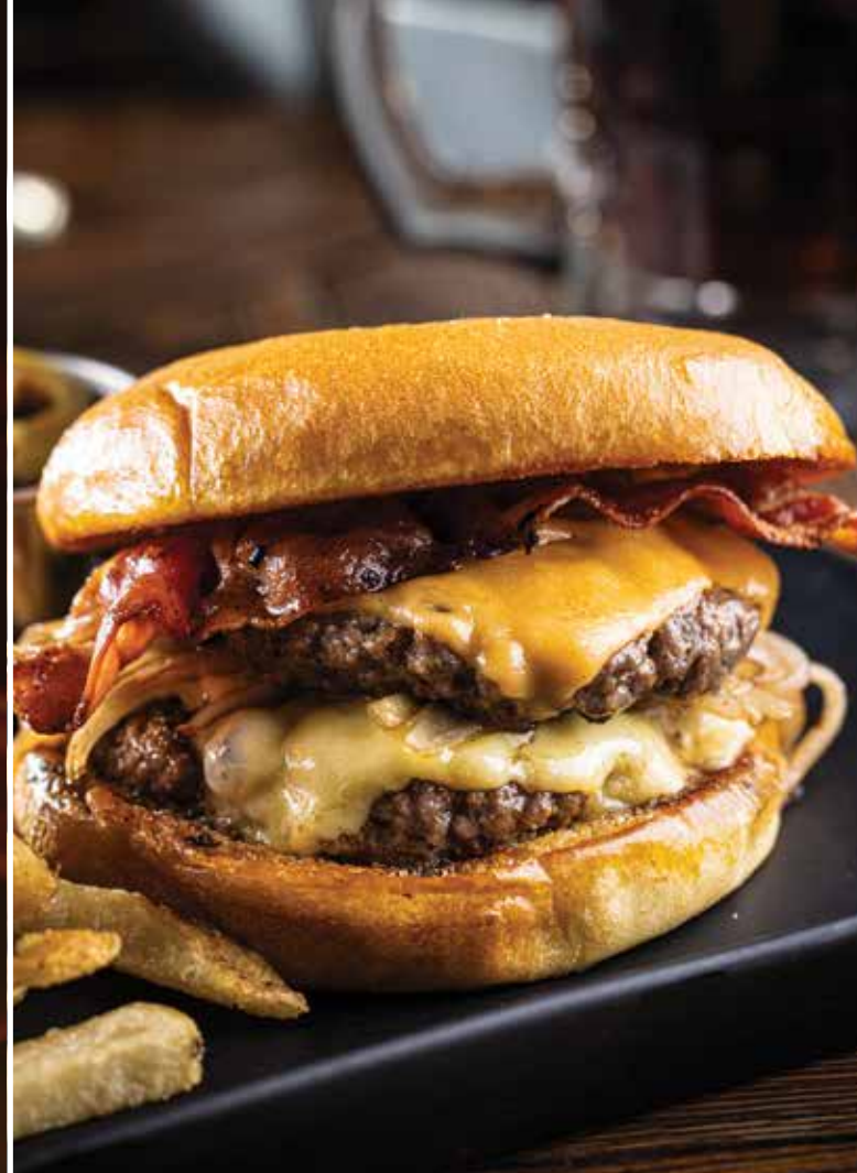
SMASH BURGUER BACON

All hamburguers come with french fries or sliced potatoes and jalapeño chili. Add cheese and bacon $30 Add cheese and chili $40