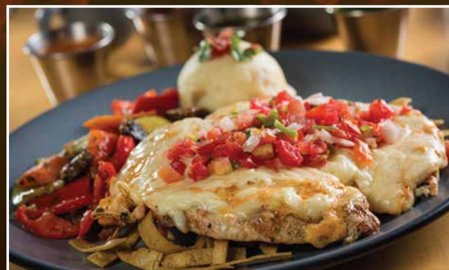
CARBONERA CHICKEN BREAST

BREADED CHICKEN STRIPS $269 Breaded chicken strips (300g)*, covered with your favorite sauce, with potatoes and grilled corn.