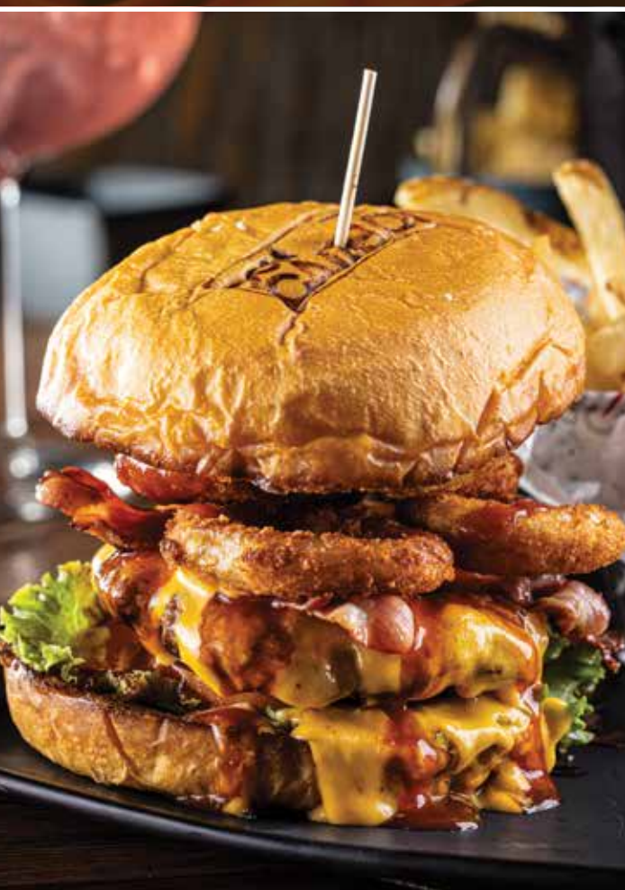
SPICY ONION BURGUER

SPICY ONION BURGUER $219 Sirloin patty (200g)*, onion rings covered un nacho queso sauce and chipotle BBQ.